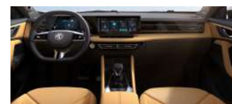
Model shown: Luxury grade