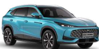
● Arctic Blue Metallic paint