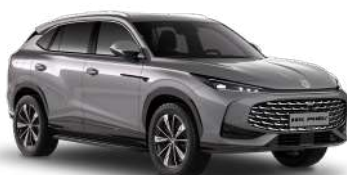
● Hampstead Grey Metallic paint