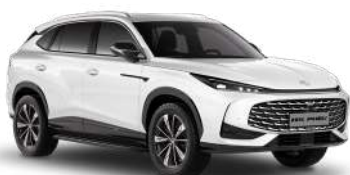
○ Pearl White Metallic paint