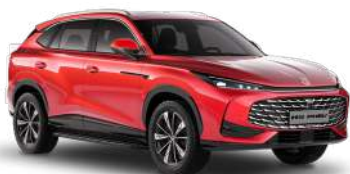
● Diamond Red Metallic paint