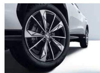
19" Alloy wheels Comfort / Luxury