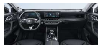
Model shown: Luxury grade