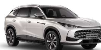
● Sterling Silver Metallic paint