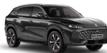
● Pebble Black Metallic paint